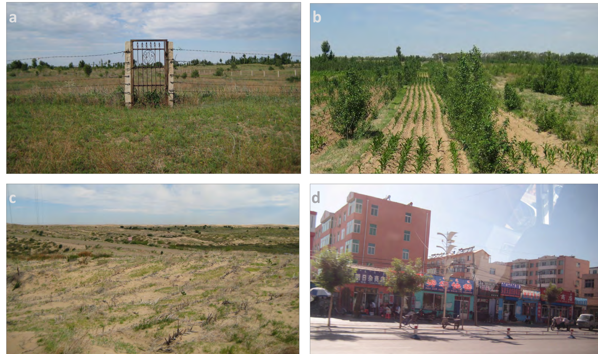
Fig. 1 Four dominant land use/land cover categories in contemporary Inner Mongolia: (a) Grassland, primarily used for grazing livestock; (b) Cropland, typically converted from former grassland; (c) Degraded grassland, here undergoing restoration measures; (d) Urban development.

The Mongolian Plateau contains a vast area of grassland straddling the border between northern China and Mongolia. Historically inhabited by pastoralists who migrated seasonally with livestock herds, these areas have undergone drastic changes over the past thirty years due to shifts in land tenure and livestock ownership, globalization, and urbanization. 1 Rapid ecological and socioeconomic changes have caused significant grassland degradation. 2