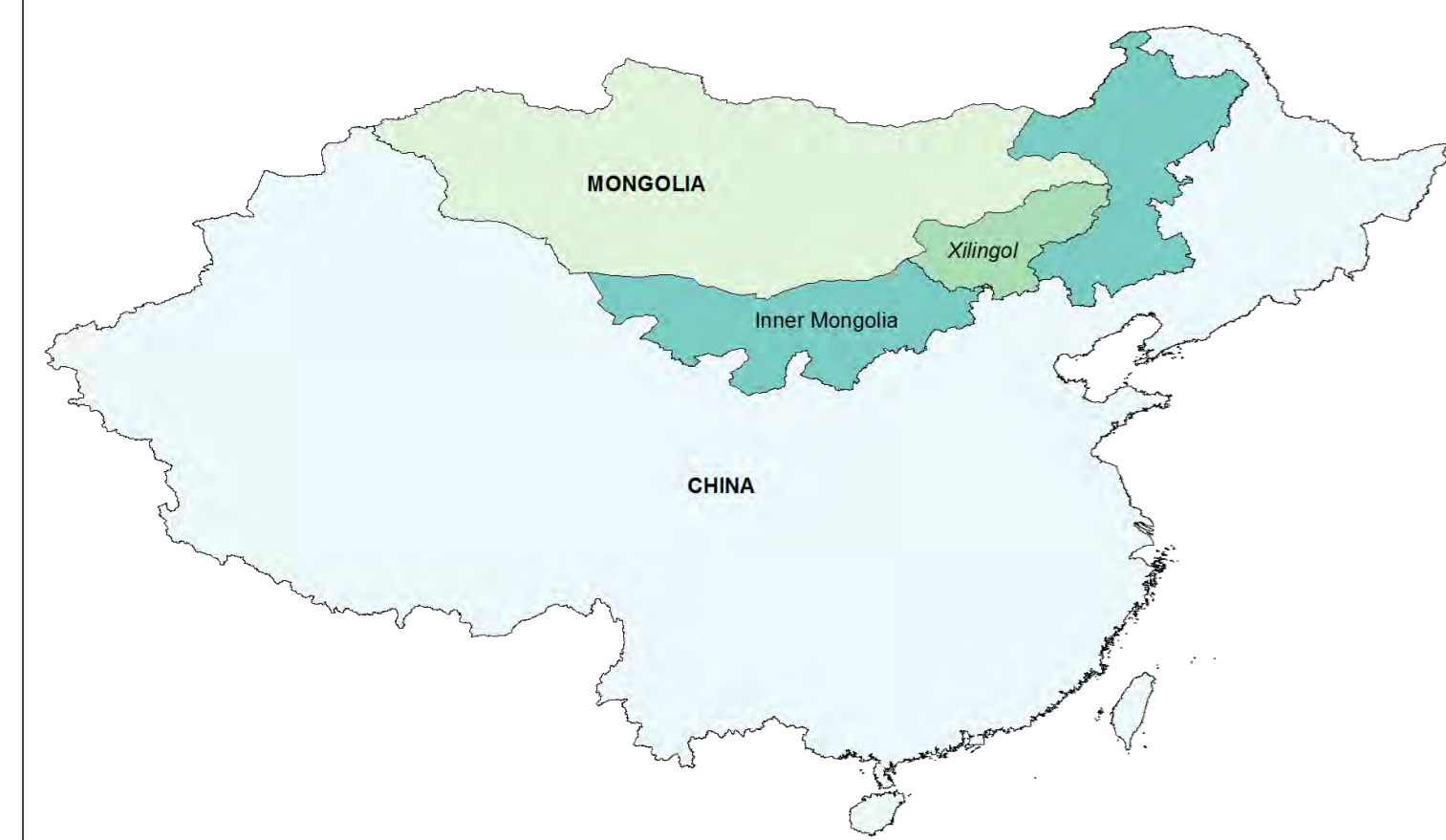
Fig. 2 Map of the study area, Xilingol League.

Policies are in place to protect the grasslands and limit cropland expansion, but it is unclear how future changes in climate the economy will affect grassland sustainability. In order to respond to future uncertainty, we need a better understanding of the inter-connectivity between human, natural, and livestock sectors of the Plateau system. In this study we use a system dynamics approach to explicitly link the social, environmental and land-use sectors to reveal underlying dynamics in this arid rangeland system.